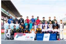
FIA Formula 3 Class of 2019